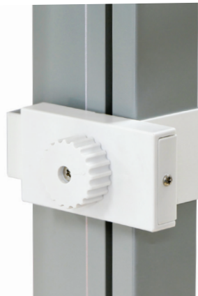
L Link Connector