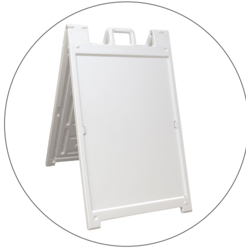
Signicade Deluxe (qty 1)