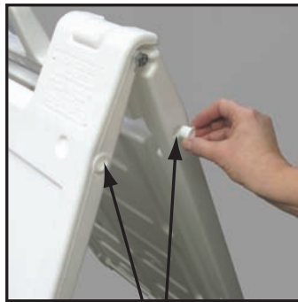
Sand Fill Holes

Each sign frame has four fill holes, two on each side of the frame.